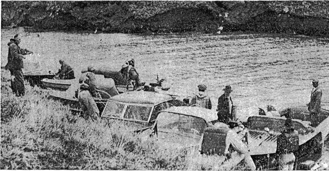
Members of the search floatilla preparing to renew the dragging operation for Nold's body Monday.